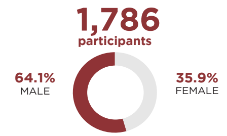
Topic 3: Cross-Generational Relationships

"Do you think [a girl infected with HIV] should tell her teachers about her status?' Yes/No? Why?"